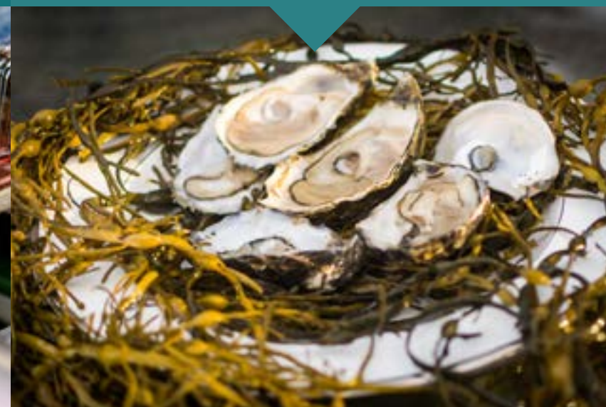
Explore an oyster farm