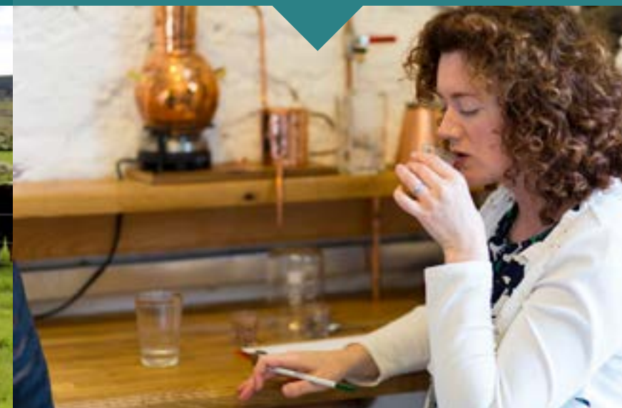
Forage and make your own Gin