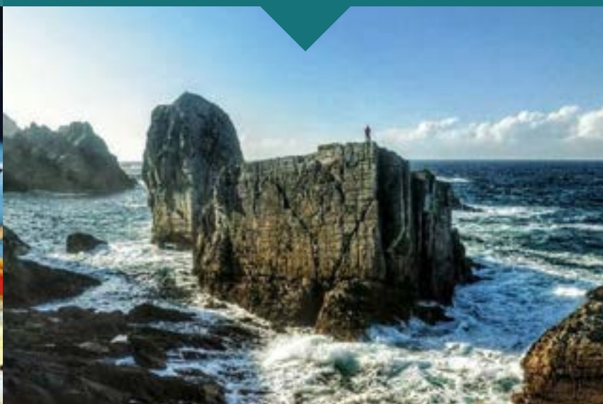
Sea stack climbing in the coolest place on earth