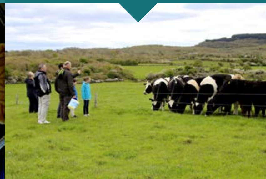
Nature & archeology hike with a Burren farmer