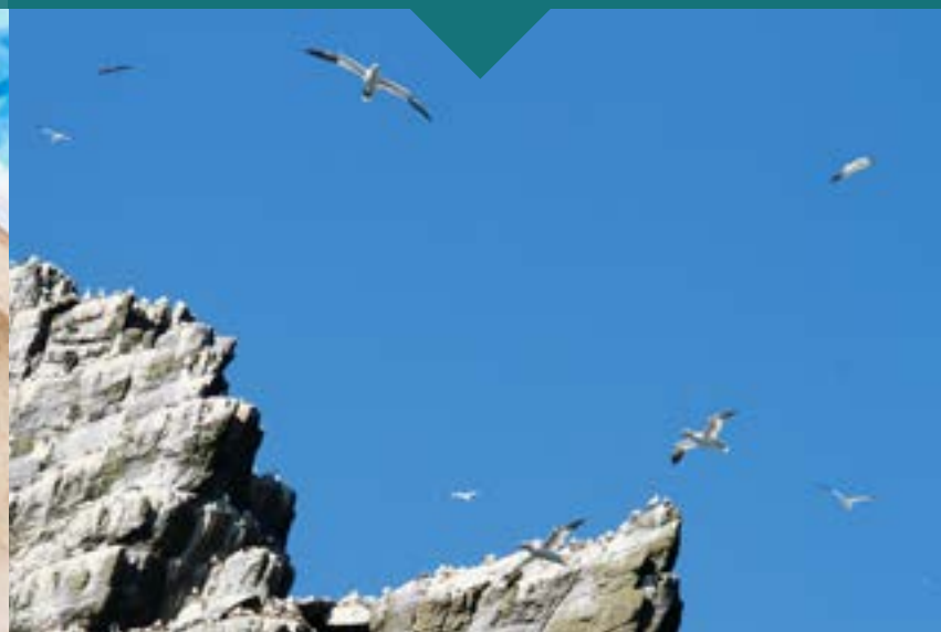
Birdwatching on a private island