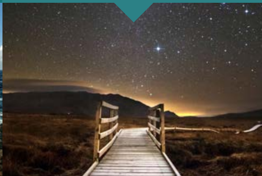
Stargazing in Mayo's dark skies