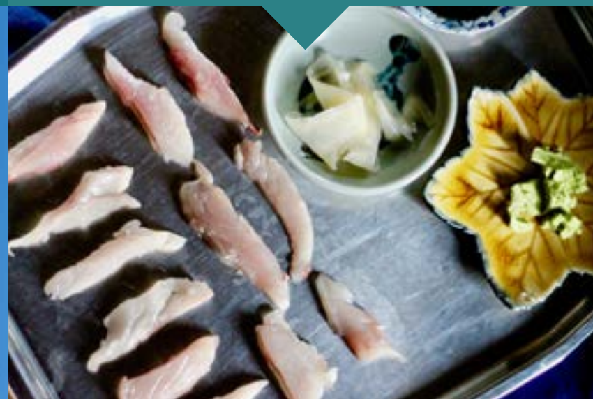
Gourmet fishing on the Wild Atlantic Way