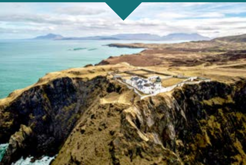
Island lighthouse exclusive use