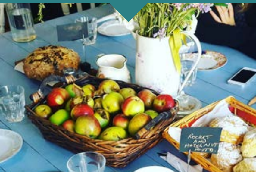
Foodie walk in Northern Ireland