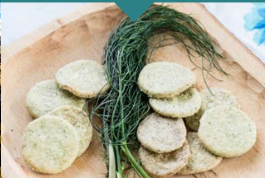
Wild seashore foraging