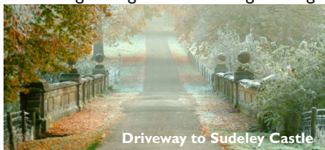
Driveway to Sudeley Castle

Go through the gate and turn right along